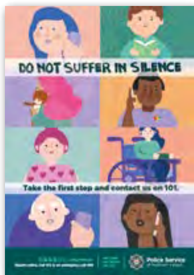
Posters are available as A4 and A3 size, with and without printers crop and bleed marks.